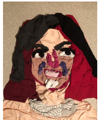
Students examples above